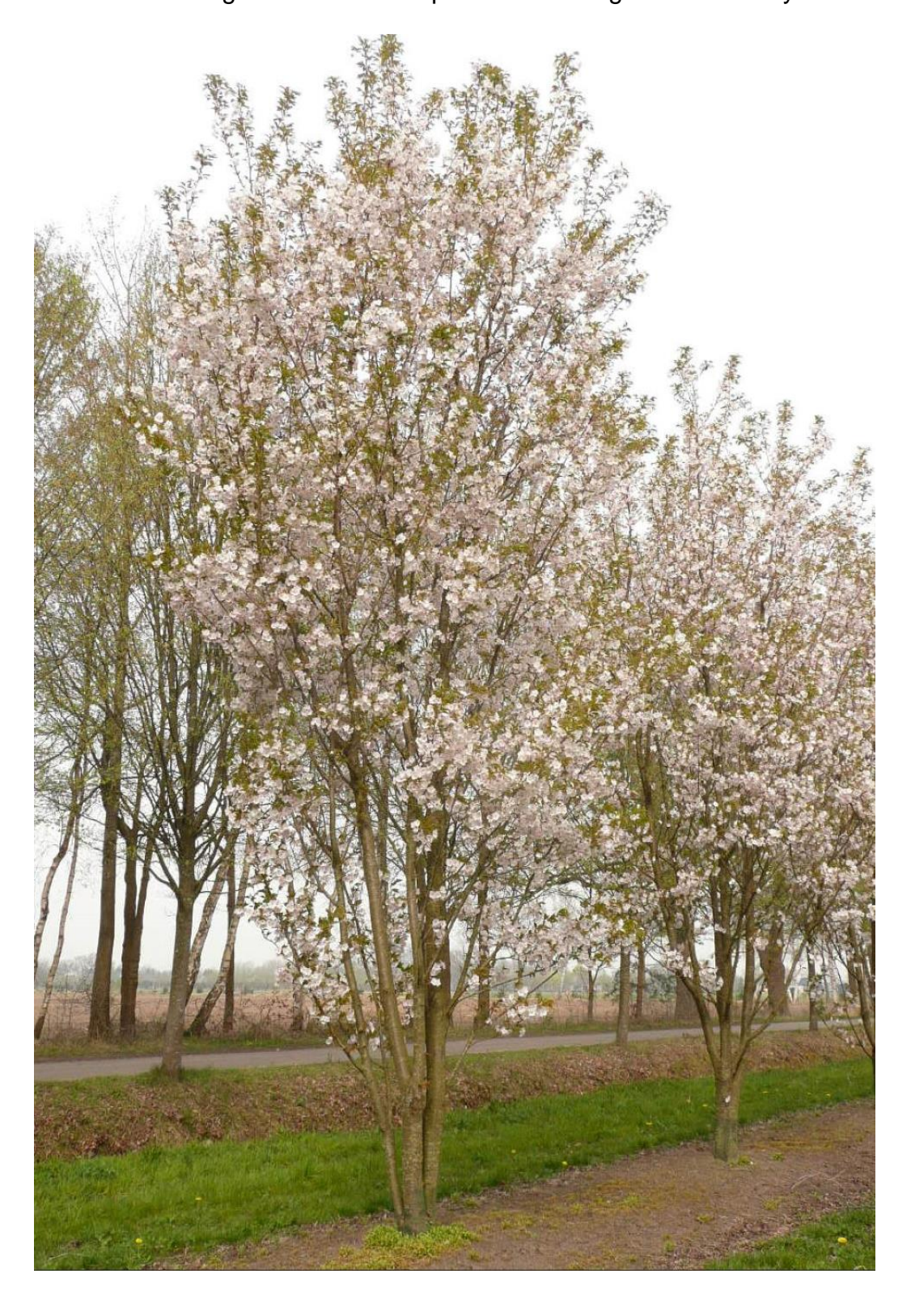
Prunus 'Sunset Boulevard' – Cherry Spring flower interest and Autumn colour – good for bees min 20-25cm girth 5m tall when planted reaching 10m after 25 years